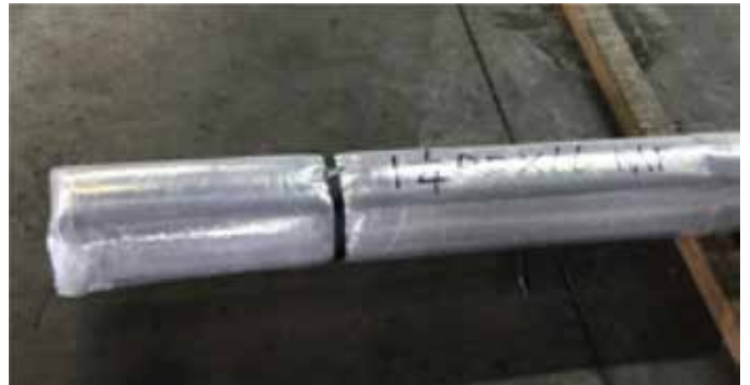
Bare Bundles - Polished standard

Bare Tubes & Pipes wrapped with stretch film.