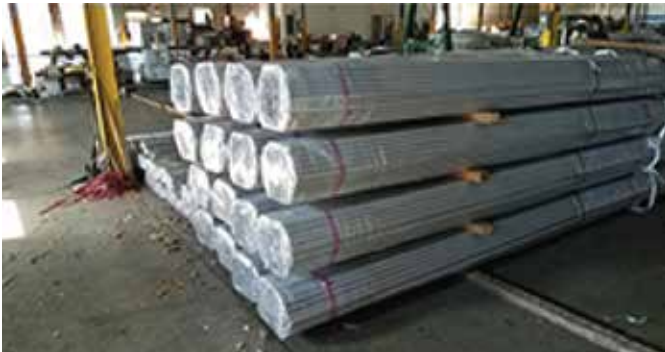
Bare Bundles - Mill Finish standard

* Custom packaging available upon request *