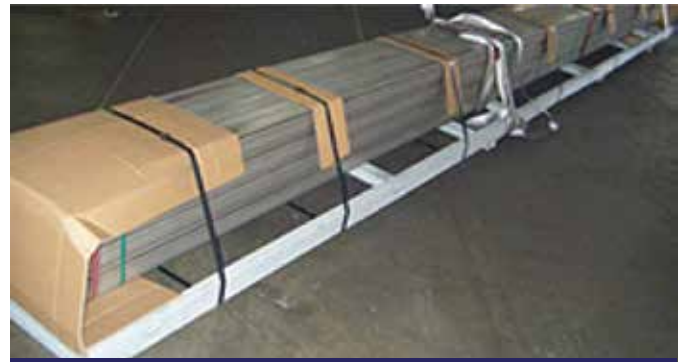
Steel Base optional

Bare Pipes wrapped with Polyethylene film