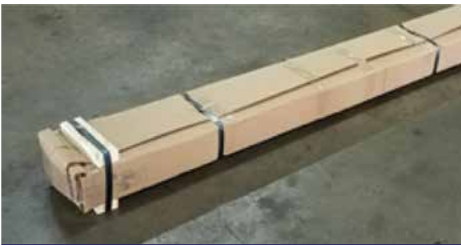
Corrugated Box optional

Standard bundles packed and steel strapped onto a steel base