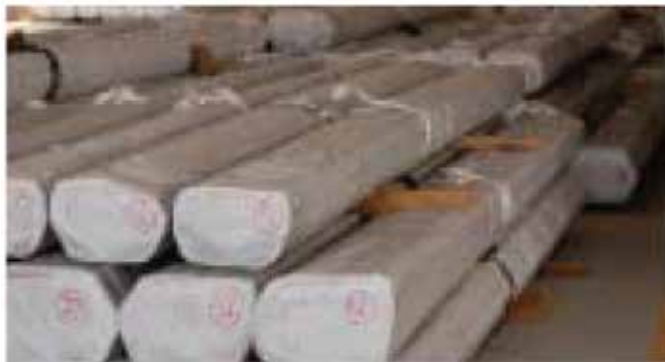
Polyethylene Film standard

Individually Plastic Sleeved Tubes & Pipes wrapped with stretch film.